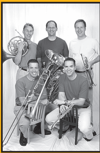
St. Anthony Brass Quintet